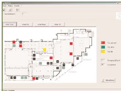
Transport order disposition