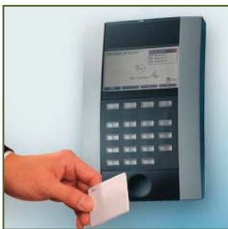
Time keeping terminal