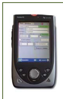
Portable project time collection